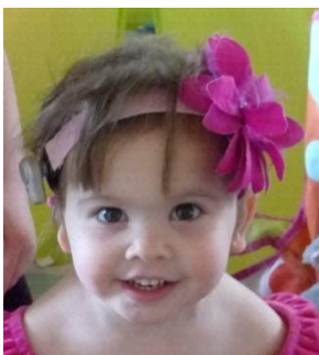
Microtia Atresia of the right ear

Ear Community's mission has always been to promote awareness, education & advocacy for parents & medical professionals around the world. We bring families together in the same situation, so they never feel alone with Microtia & Atresia. Since 2010, Ear Community has brought over 15,000 people together throughout the world at our events & has helped educate hundreds of thousands of people through our website. Ear Community has donated over 150 bone anchored hearing devices to needy children & adults as well as awarding college scholarships. Ear Community is the first nonprofit to shine a light on our rare cause, solely helping children & adults with Microtia & Atresia, as well as their families.