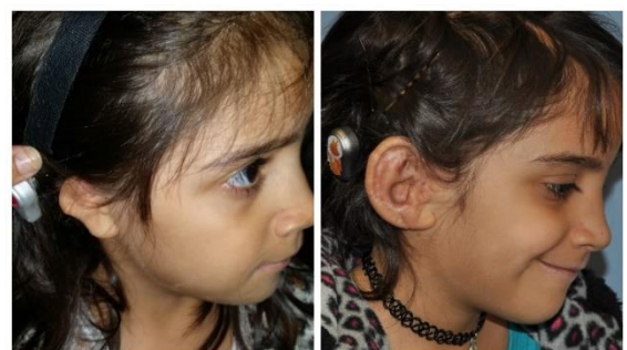
Ear reconstructive surgery before and after

If you enjoy donating to charities, please consider donating to the Ear Community Organization and help individuals born with Microtia and Atresia receive emotional support, obtain hearing devices, college scholarships, and more!