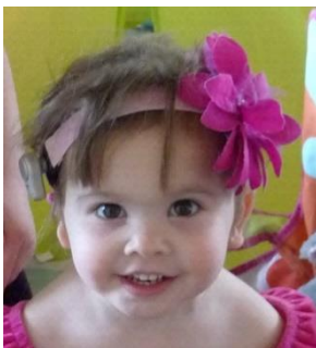
Microtia Atresia of the right ear

Ear Community helps promote awareness and education for thousands of parents and medical professionals around the world. Since 2011, Ear Community has helped bring together nearly 10,000 people in different countries through our family events and has helped educate thousands of people through our website. Ear Community has donated over 100 hearing devices to needy children and adults in many countries. The organization also grants college scholarships and helps with financial assistance toward reimbursement of travel costs when planning for surgery (when funds are available). Help us raise awareness and promote education every November 9 th during National Microtia Awareness Day!